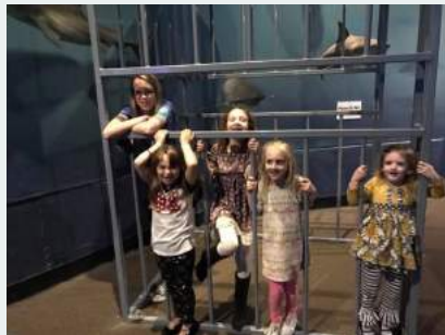
Oklahoma Aquarium Trip March 26, 2017