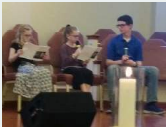
Youth Sunday— March 5, 2017