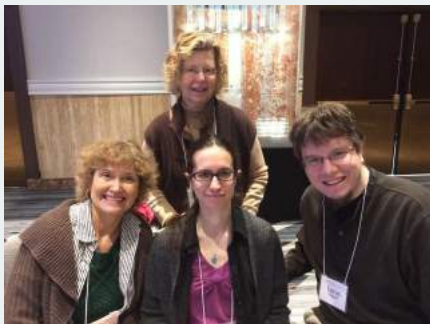
NextChurch Conference 2017 attended by these 4 wonderful people!