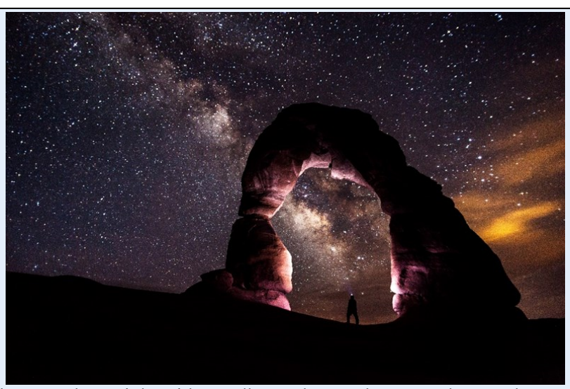
("Delicate Arch at Night with Headlamp" at Arches National Park in Grand County, Utah, 2013)

"When I look at your heavens, the work of your fingers, the moon and the stars that you have established; what are human beings that you are mindful of them, mortals that you care for them?" – Psalm 8:3-4