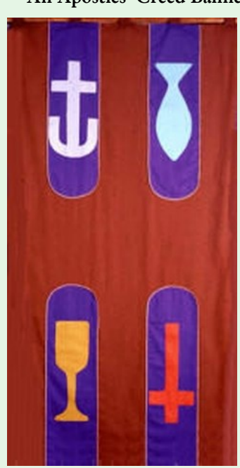
An Apostles' Creed Banner

Although not written by apostles, the Apostles' Creed reflects the theological formulations of the first century church. The creed's structure may be based on Jesus' command to make disciples of all nations, baptizing them in the name of the Father, the Son, and the Holy Spirit. In a time when most Christians were illiterate, oral repetition of the Apostles' Creed, along with the Lord's Prayer and the Ten Commandments, helped preserve and transmit the faith of the western churches. Additions were made to the creed in the second, fourth and fifth century. By the eight century the creed had attained its present form. (Book of Confessions – PCUSA)