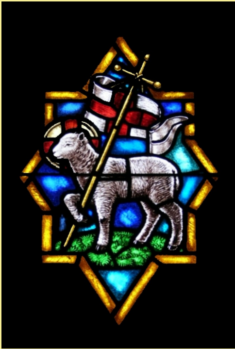
We are marching in the light of God... ~South African freedom song, Siyabamba