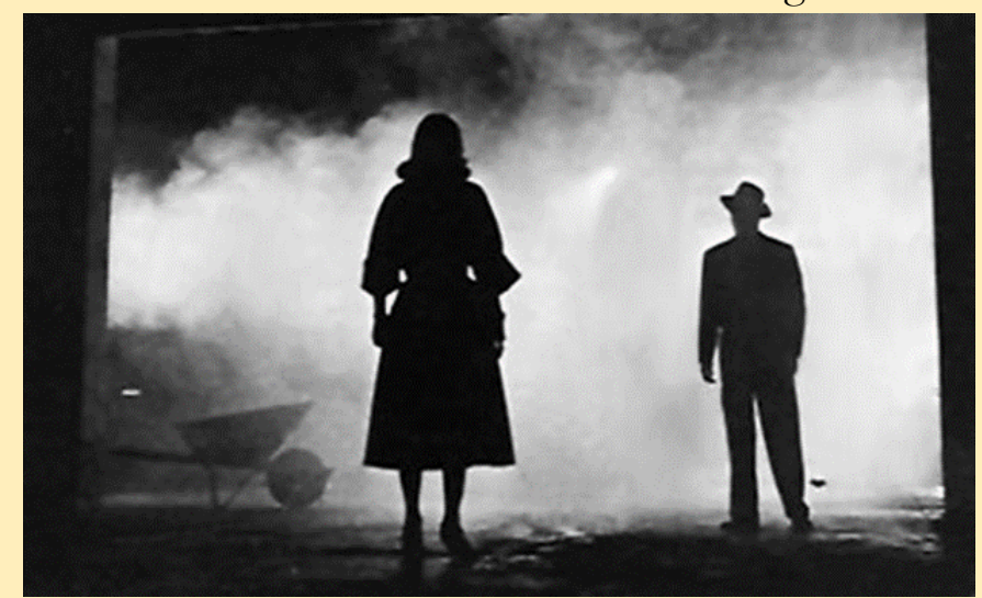
(Screenshot from "The Big Combo" (1955) dir. Joseph Lewis)

"We don't focus on the things that can be seen but on the things that can't be seen. The things that can be seen don't last, but the things that can't be seen are eternal." -2 Corinthians 4:18